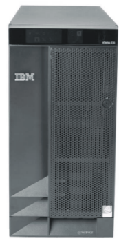
1 x IBM xSeries 235 1 x 3.06GHz/512KB Xeon DP 3 x Mylex AcceleRAID A352 Adapters 1 x 18.2GB Drive 2 x 73.4GB Drives